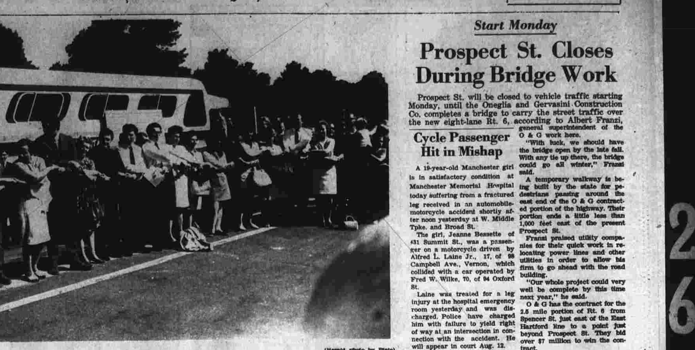
Visitors from Coventry, England, and their hosts join in song at parting today after stay of nearly three weeks.

Manchaster Modes Merger Planned with First Hartford (Continued from Page One) The new director of Project Concern, the buying of Hartford primary grade pupils to be maintained in the city, is missing it, says the 47th American Legion, which has been in contact with the Hartford Board of Education and will take effect Aug. 1.